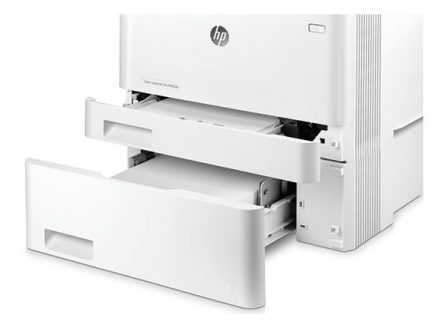
HP LaserJet Pro M452dn with optional 550-sheet tray