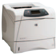
hp LaserJet 4200/n and hp LaserJet 4300/n

Exceed workgroup expectations with the HP LaserJet 4200 and HP LaserJet 4300 series' consistently high performance and print quality. Intelligent, versatile and reliable, these monochrome printers offer a wealth of features designed to make them easy to use and manage.