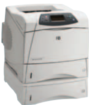
hp LaserJet 4200dtn and hp LaserJet 4300dtn