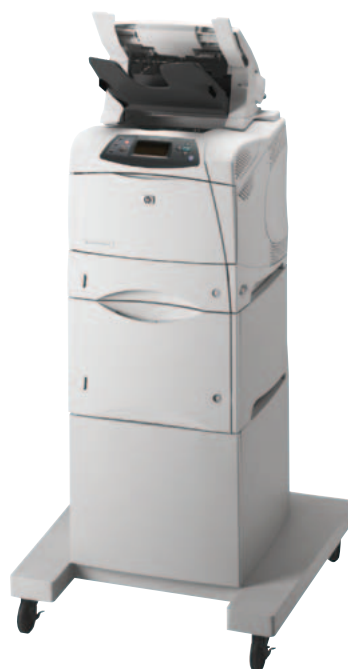
hp LaserJet 4200/4300 printer with additional accessories