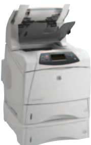
hp LaserJet 4200dtnsl and hp LaserJet 4300dtnsl

For business users in enterprise, large, medium and small organisations the HP LaserJet 4200 and HP LaserJet 4300 series offer reliable HP LaserJet performance, unrivalled versatility and an easy to use and manage solution which meets the high printing demands of workgroups of 5-15 users.