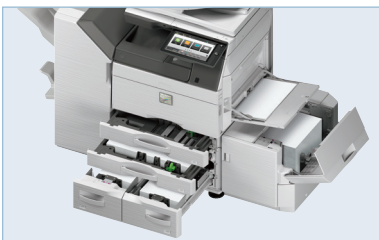
Provides up to six paper sources for a maximum paper capacity of 6,300 sheets.