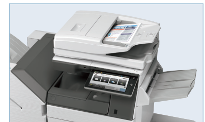
Sharp's ImageSEND™ feature provides one-touch distribution to email, cloud applications and more.