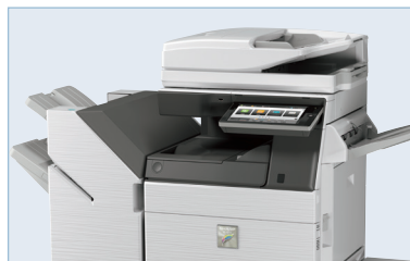
Select staple finishers also offer manual stapling and stapleless stapling.