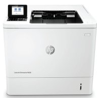
HP LaserJet Enterprise M608n

This HP LaserJet Printer with JetIntelligence combines exceptional performance and energy efficiency with professional-quality documents right when you need them—all while protecting your network from attacks with the industry's deepest security. 1