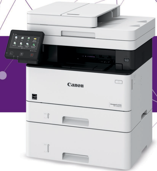
Shown with optional cassette.

Designed for small and medium-size businesses, the imageCLASS MF426dw/MF424dw models balance speedy performance, minimal maintenance, and the ability to add an extra paper tray. A 5" color touchscreen delivers an intuitive user experience and can be customized by a device administrator to simplify many daily tasks.