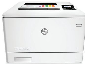
HP LaserJet Pro M452dn

Ideal printing performance and solid security for how you work. This capable colour printer finishes jobs faster and delivers comprehensive security to guard against threats. 1 Original HP Toner cartridges with JetIntelligence produce more pages. 2