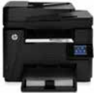
(HP LaserJet Pro MFP M225dw)