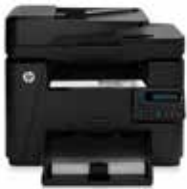
(HP LaserJet Pro MFP M225dn)

This powerful MFP increases productivity with automatic two-sided printing, an intuitive touchscreen with scan-to options, easy wireless connectivity, 1 built-in networking, security features, and mobile printing options. 8