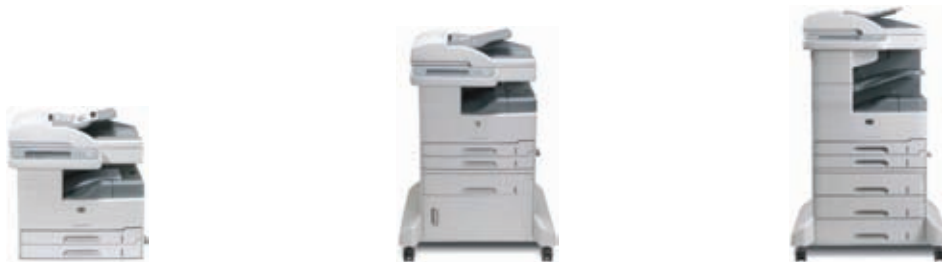
HP LaserJet M5035 MFP