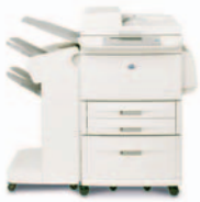
HP LaserJet 9040mfp with optional stacker

Simplify business communication processes with affordable, high-performance printing, copying and scanning up to A3, scan-to-email, document finishing, optional faxing 1 and digital sending 2 features for demanding workgroups and departments.