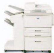
HP LaserJet 9040/9050mfp with stapler/stacker

Stacks up to 3,000 sheets of paper with job offset.