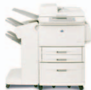
HP LaserJet 9040/9050mfp with stacker

Each mailbox bin can be assigned to an individual, workgroup or department for easy job retrieval. The mailbox may also be configured as a sorter/collator, stacker and job separator.