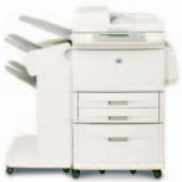
HP LaserJet 9050mfp with optional stacker

Departments in commercial and enterprise businesses – and multiple departments in medium-sized businesses – with workgroups of 30 – 50 requiring easy networked access to cost-effective, fast and reliable black-and-white printing and copying up to A3, colour scanning, plus a range of fax, finishing and digital sending options for enhanced efficiency, improved productivity and streamlined workflow.