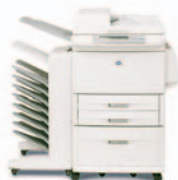
HP LaserJet 9040/9050mfp with 8-bin mailbox

Power cord, print cartridge, printer documentation, printer software CD-ROM, control panel overlay, two standard 500-sheet input trays, 100-sheet multi-purpose tray, 2000-sheet input tray, automatic duplexer accessory (pre-installed), HP Jetdirect Embedded Print Server, automatic document feeder (ADF). Necessary paper output device to be chosen and ordered separately.