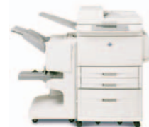
HP LaserJet 9040/9050mfp with multifunction finisher

Provides 3000-sheet stacker capabilities as well as multiposition stapling for up to 50 sheets of paper per job.